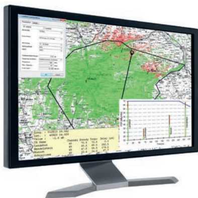
CHIRplus_BC: eMBMS planning

As with any network rollout, efficient network planning is key to overall (F)eMBMS network efficiency. CHIRplus_BC was first sold in 1994 and since then has always included the latest ITU standards and recommendations, as well as continual improvements through hands-on user experience and customer feedback. It includes extensive features for single frequency network (SFN) planning. The multithreading network processor, which calculates several results simultaneously, reduces the calculation time for nationwide network calculations considerably. For single frequency networks, the network processor also covers the calculation of self-interference and statistical network gain. ■