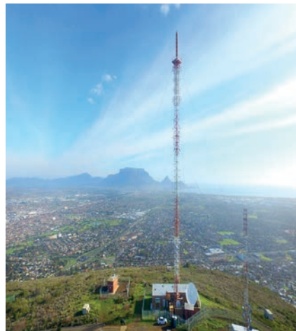
Sentech's Tygerberg transmitting facility

The collaborative team are now awaiting the outcome of a suitable trial license, which will have to be granted by the Independent Communications Authority of South Africa (ICASA). ■